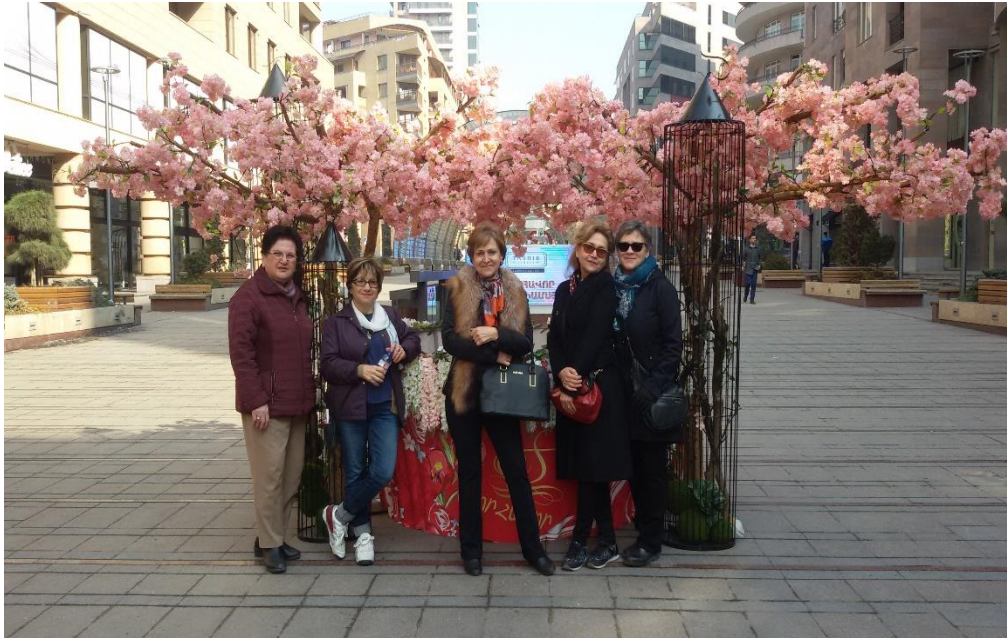
The second leg of the city tour on March 8