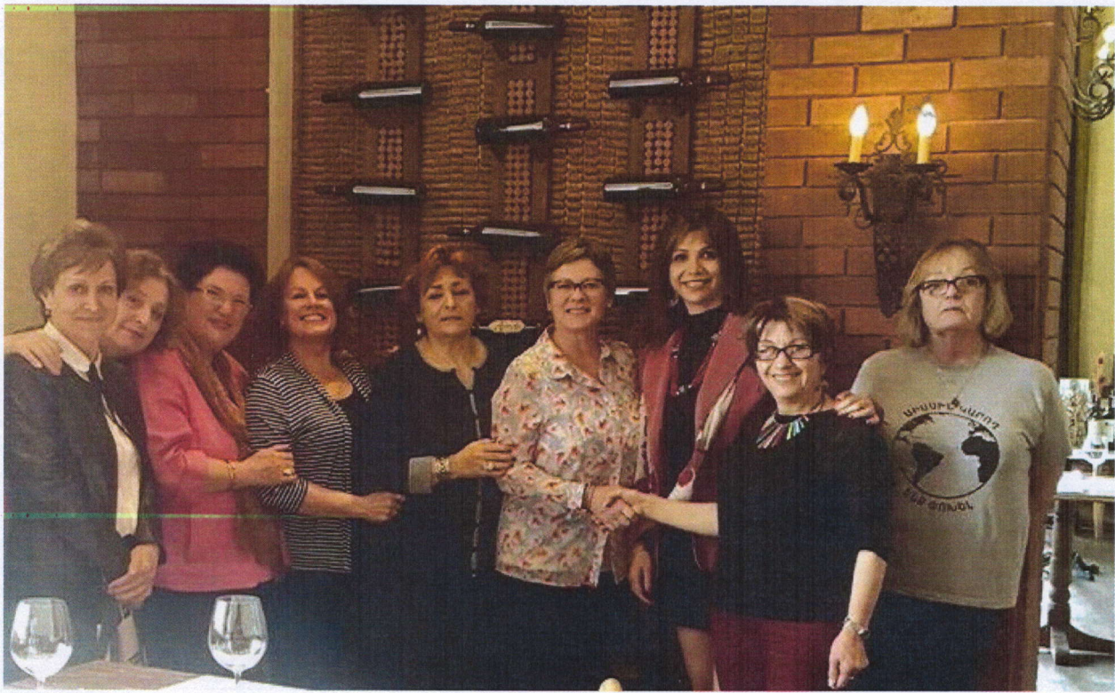
2017-2018 IWAY OFFICERS AND DIRECTORS