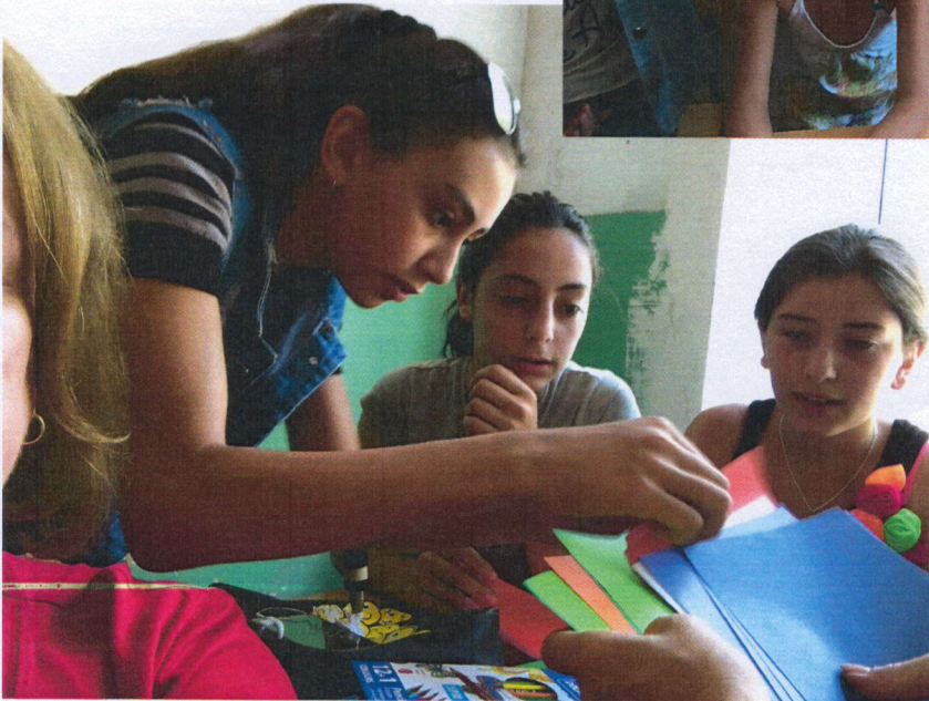
Students loved selecting colors for origami project.