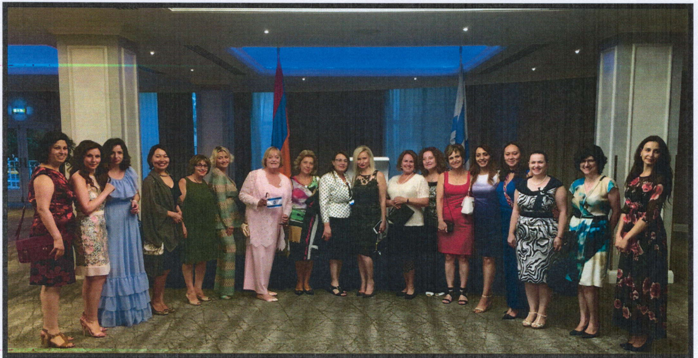
ISRAEL-ARMENIA CONSULATE INVITED IWAY MEMBERS TO THEIR CELEBRATION OF 69TH YEAR OF FREEDOM