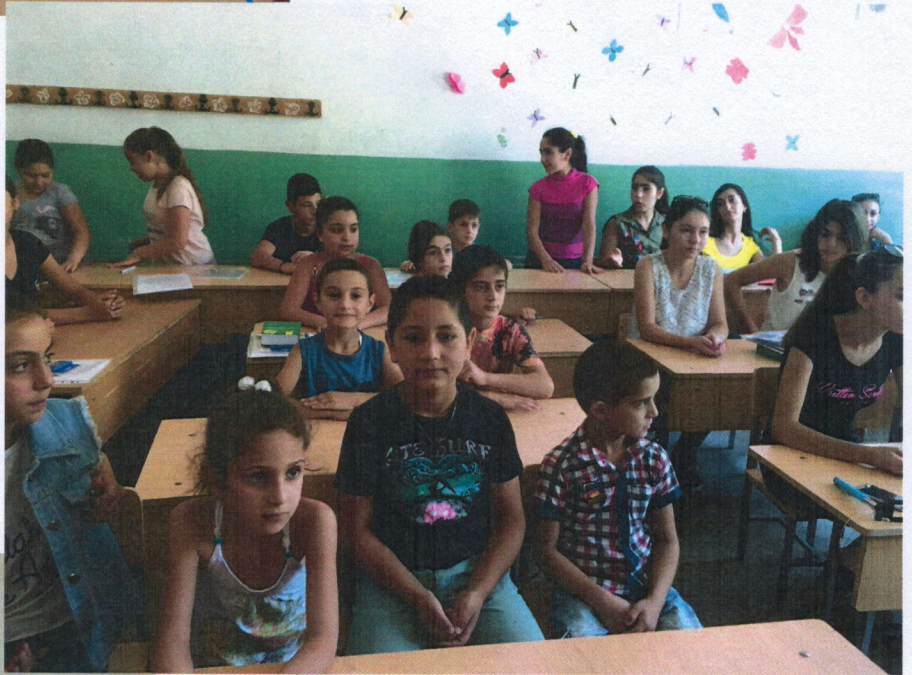
Students eager to learn