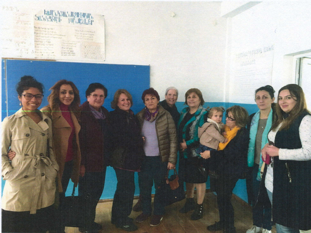
TOUR OF THE SCHOOL IN SURENAVAN