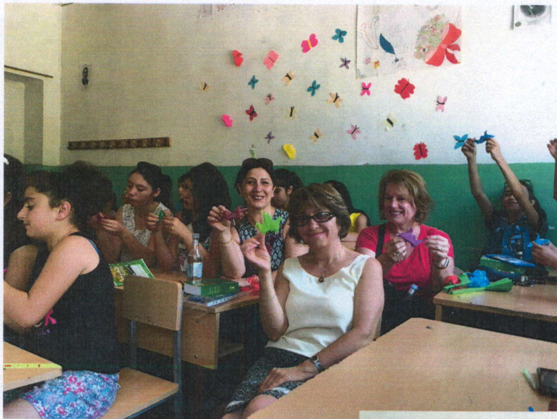
IWAY joined the students in class.